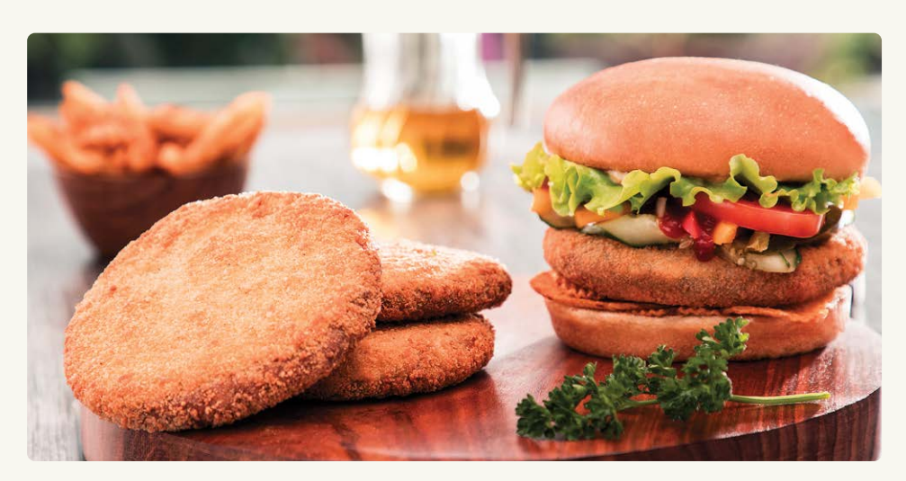
CHICKEN BURGER PATTY