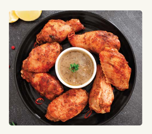
CHICKEN WINGS - PERI PERI

Behold the bold barbeque taste of these tender and juicy wings. As they are oven roasted, they definitely make for a healthier alternative.