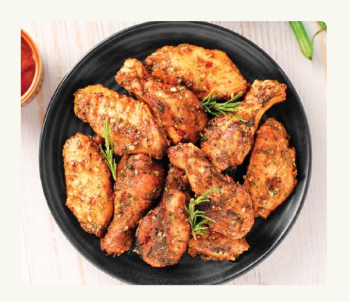
CHICKEN WINGS - BBQ

Behold the bold barbeque taste of these tender and juicy wings. As they are oven roasted, they definitely make for a healthier alternative.